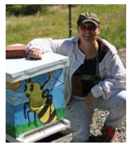
The Difference Between a Poison and a Remedy

Most people hate reading "the directions". Who wants to waste all that time when we can jump in and just figure it out, right? Following the directions can be even worse. Just today, I was floating through my lab checking on students who were working on an assignment. When I asked one group how they were doing, they said "Fine, but we started on Exercise 1 and then realized the handout said to start on Exercise 3. So, we've wasted 20 minutes - if we only followed the directions!" Like teaching, medical directions are no exception to poor compliance. Most people do not like taking medications or giving medications to their animals. In fact, studies have shown that medical compliance with doctor's orders is systemically low with up to 75% noncompliance (1). This trend is mirrored in veterinary medicine as well (2). I get it. I would prefer not to prescribe chemicals for my patients if I could avoid it. Unfortunately, many of the disease challenges our bees face do not allow us that utopian luxury.